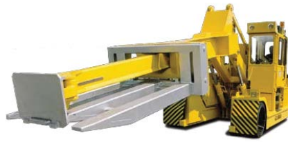
Mobile Furnace Charging Machines