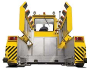
Anode Transport Vehicles