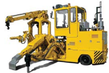
Anode Changing Machines