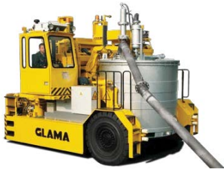
Ladle Charging Trucks