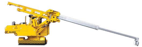
Mobile Furnace Tending Machines