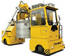
Metal Tapping and Transfer Trucks