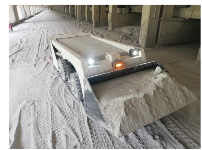
Aluminium Smelter Basement Cleaner