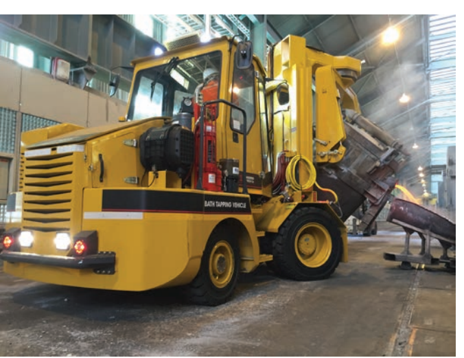
Bath Tapping Vehicle