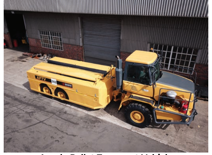
Anode Pallet Transport Vehicle